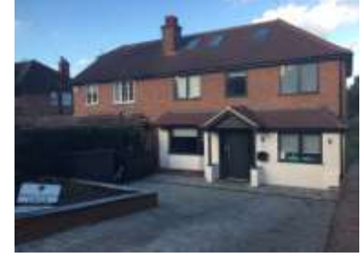
23 Gilbert Way Demolitiion of extg dwelling and construct new

2 Shrublands Road Single & two storey extns, loft conv