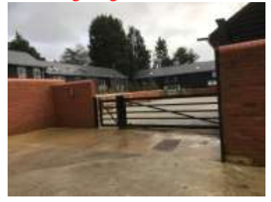
Mulberry House, Shootersway Lane Two storey front extn etc (major rebuild)

Gutteridge Farm, Ivy House Lane Conv of extg bldgs to 3 residential unitts